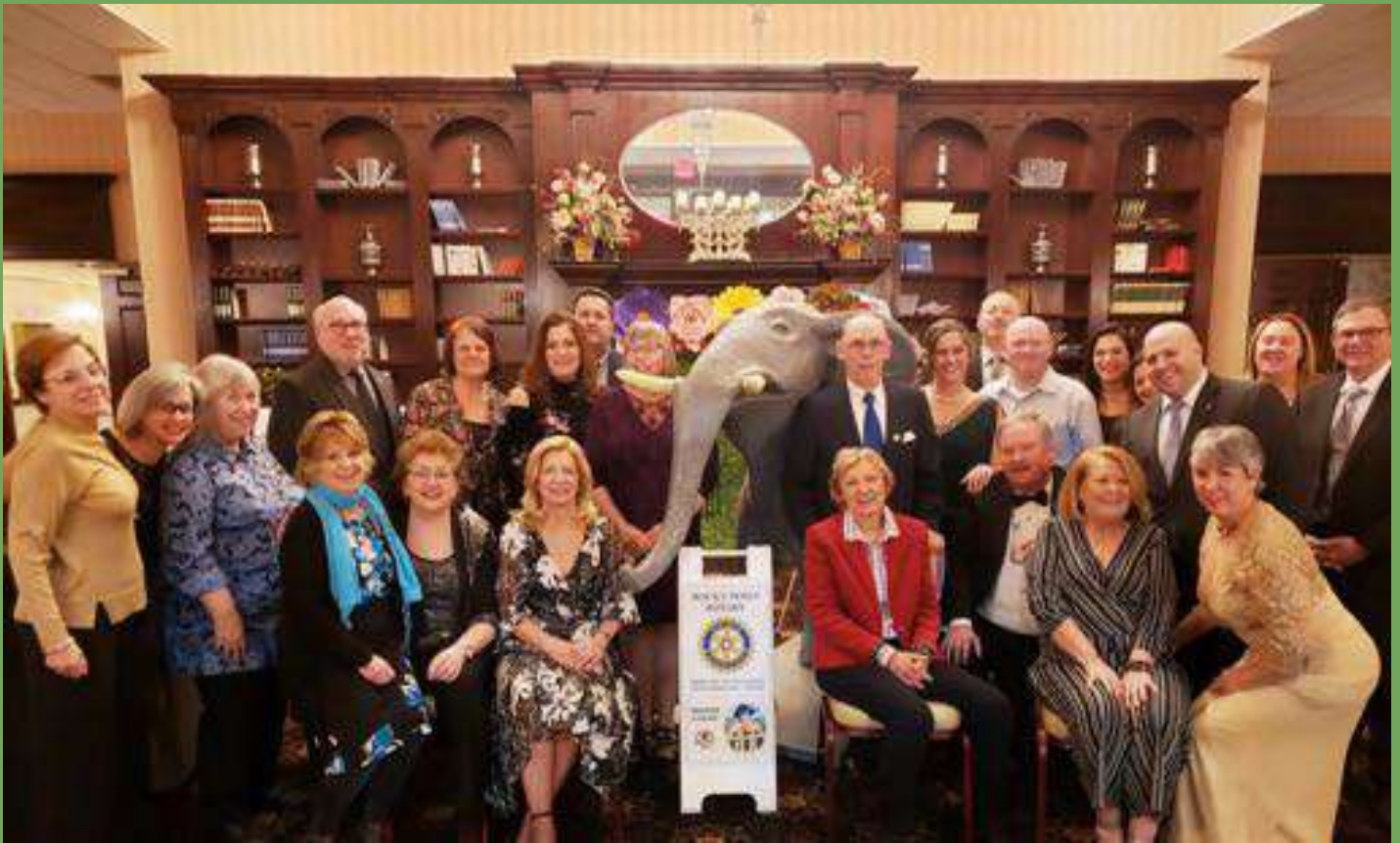
The 2020 gala included Rotarians from six clubs. In 2021 we hope to have many more Rotary clubs represented. The six clubs were Rocky Point, Port Jefferson, Stony Brook, Ronkonkoma, Eclub and Passport Club.