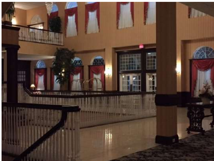
East Wind Long Island